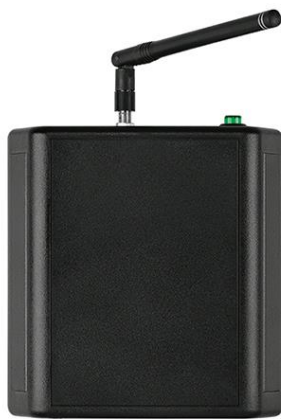
Group Control configTOOL Programmer